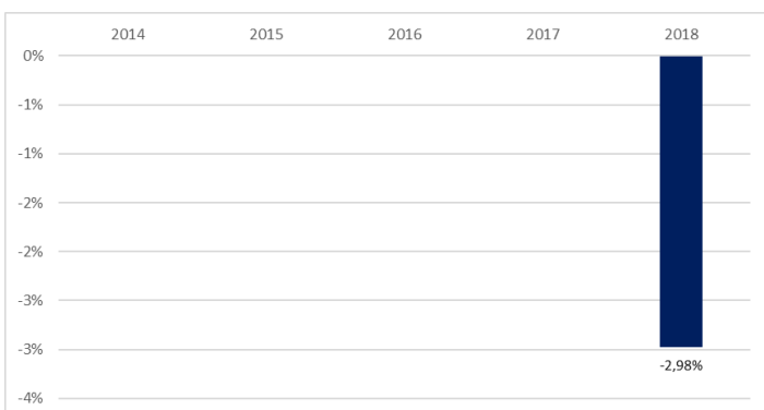
Annual performances of Varenne Valeur P-EUR